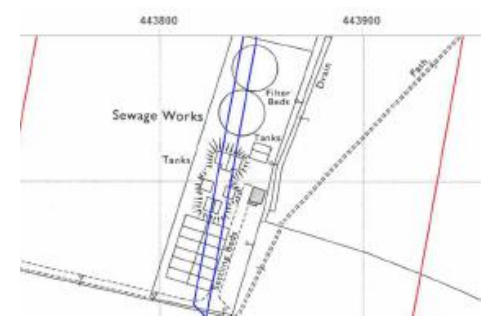
Map Extract 2: Former Sewage Works on route of B4449